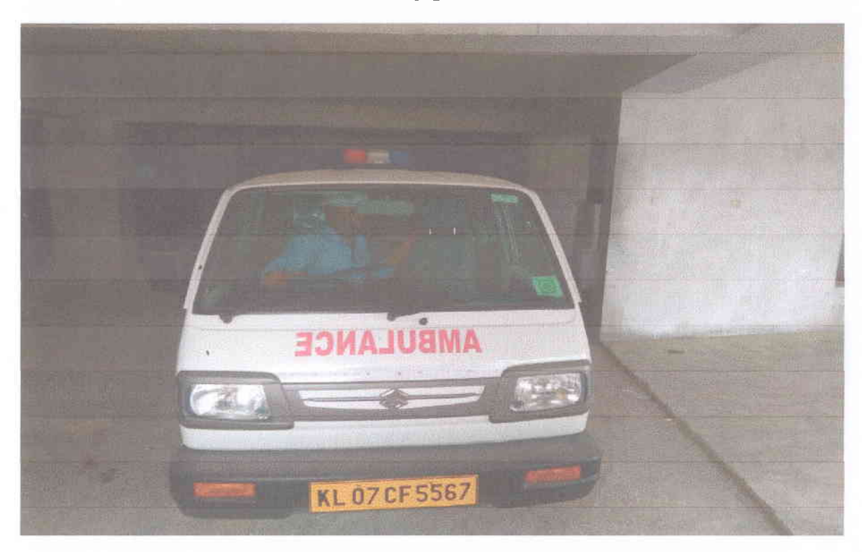
PHOT. 6 Ambulance facility provided at construction site