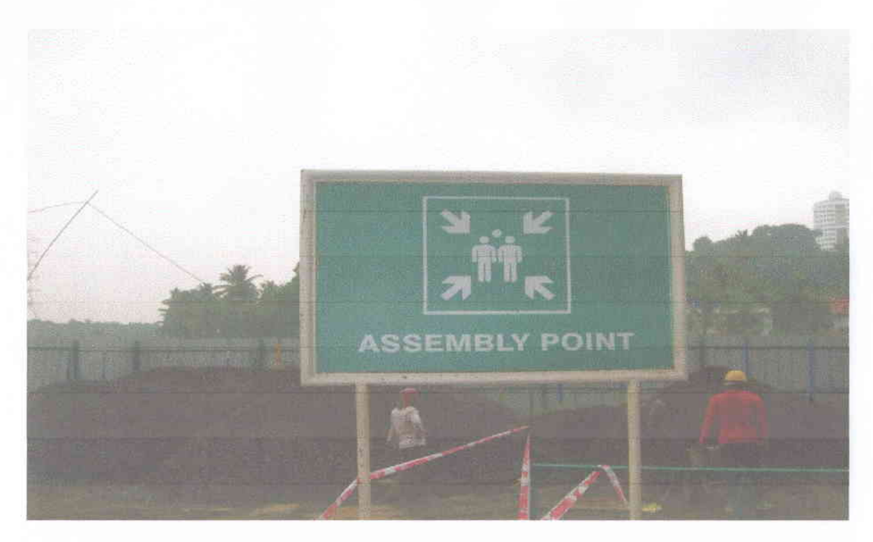
PHOT. 5 Safe Assembly point at construction site